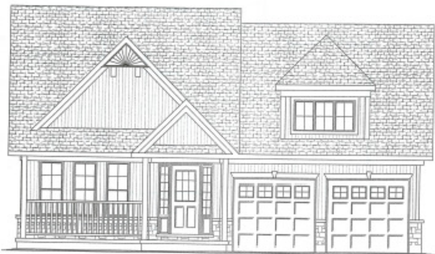
ELEVATION B3 OPTIONAL GARAGE & FRONT PORCH FINISHES WITH CONCEPT ONLY