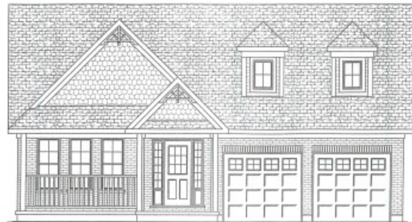
ELEVATION C1 OPTIONAL GARAGE & FRONT PORCH FINISHES WITH CONCEPT ONLY